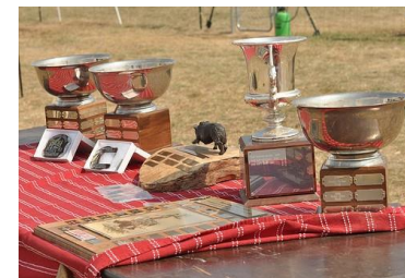
2010 Finals Trophies