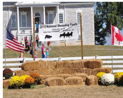
2010 National Finals Site

The VBCA is proud to have Virginia as the home for the 2010 and 2013 National Sheepdog Finals at Belle Grove Plantation in Middletown, VA.