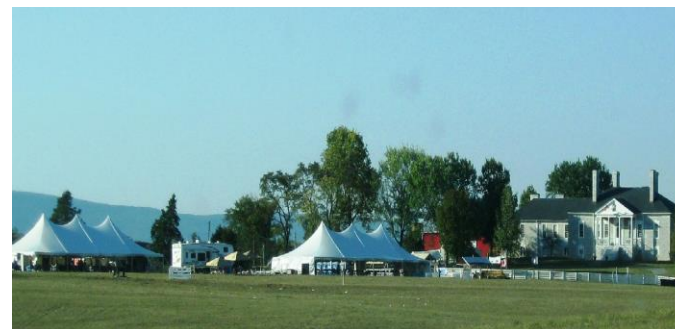
2010 National Finals Site

The Virginia Border Collie Association is established to create and support interest in the training and breeding of the working Border Collie on livestock; to conduct and promote working trials on a uniform basis throughout the state of Virginia; and to promote cordial relationships among its members and through community relations.